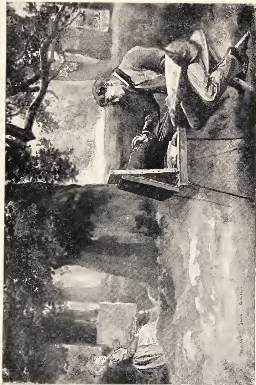
Illustration by Jack Demaree